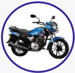
TWO WHEELER LOAN