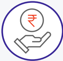
LOAN AGAINST RD / FD